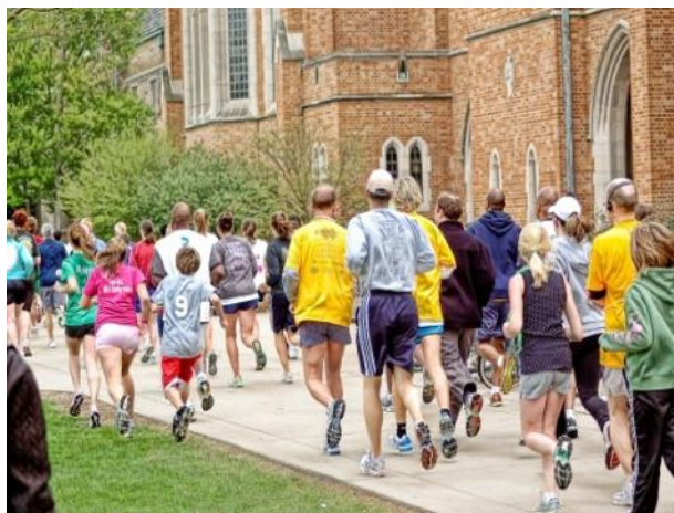
And they're off! Runners from the 2008 Inaugural Fun Run.

"Charity Begins at Home"- ND Scholarship Fund for South Bend Students