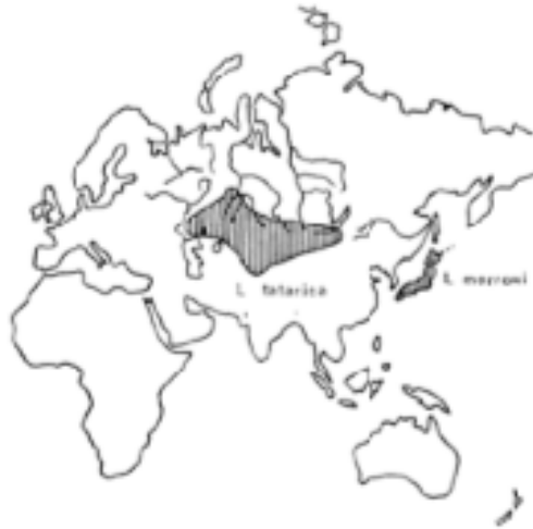
Figure 1: Illustrates the native ranges of the genetic parents of L. x bella : L. tartarica and L. morrowii . Image courtesy of Barnes 1974.