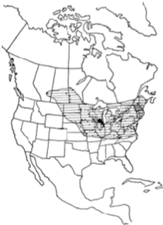
Figure 2: Illustrates the approximate range of L. x bella in the North America. Image courtesy of Barnes 1974.