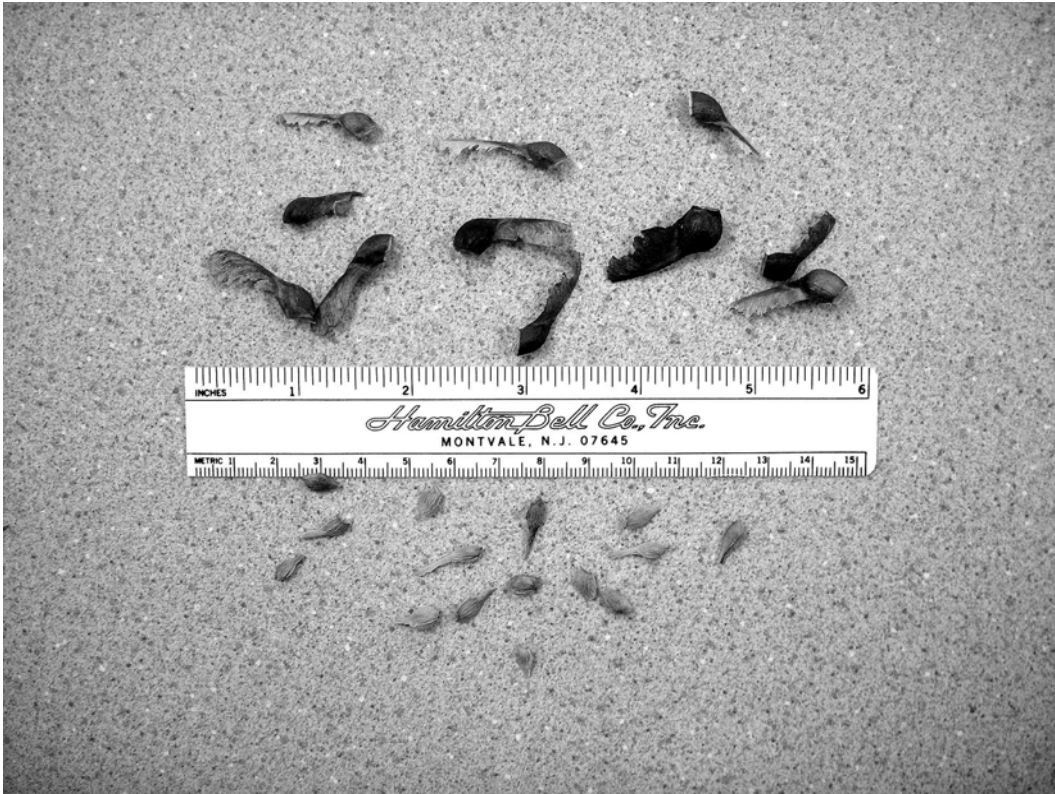
Fig. 3 Picture of seeds used in the study set against a scale. Above the ruler are sugar maple ( A. saccharum ) seeds and below are red maple ( A. rubrum ) seeds.