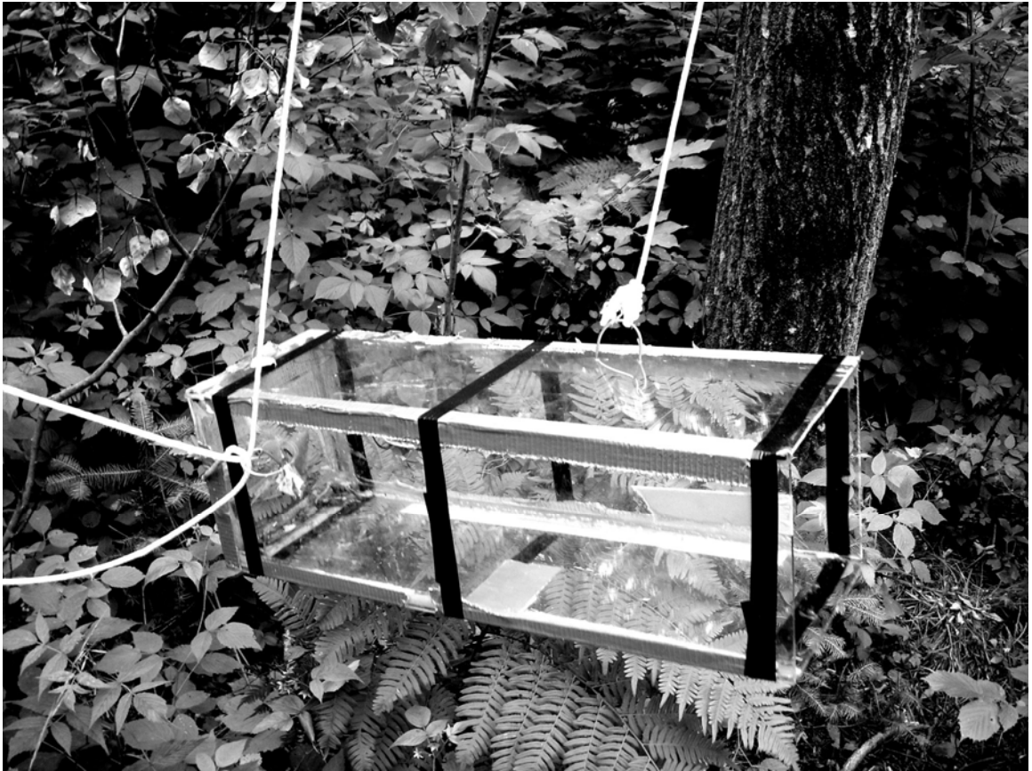
Fig. 1 Picture of tree box used in study. The three wire loops (the third is attached to the back) allows for the box to be hoisted into the canopy.