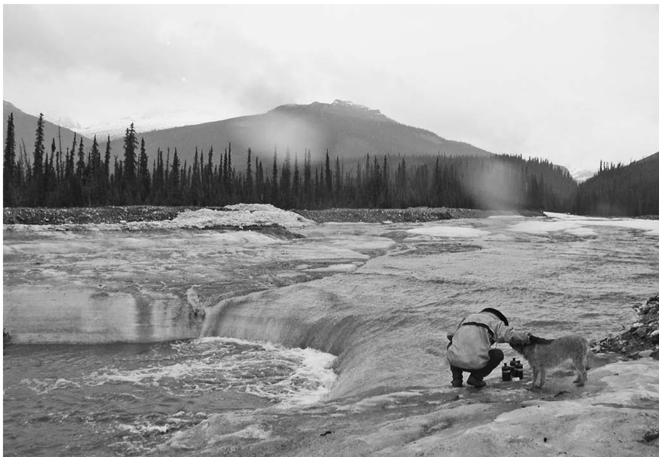
Figure 4. South of the Brooks Range of Alaska, seasonal ice and permafrost are directly (negatively) affected by temperature change. Seasonal ice and permafrost change with dominant species cover and constrain primary production, which in turn contribute to the solute loads available for export. Seasonal ice and permafrost also determine the flow paths from terrestrial to aquatic systems.

effects of global changes on aquatic ecosystem processes requires simultaneous consideration of both direct and TVS-mediated effects, otherwise predictions may inaccurately characterize the magnitude or even the direction of the effects of environmental changes on aquatic processes.