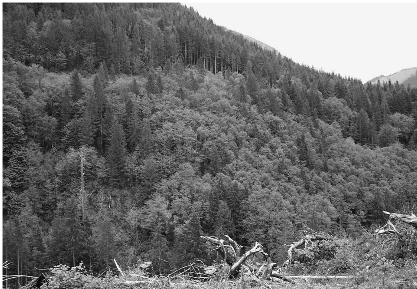
Figure 3. The long-term effects of harvesting Douglas fir (darker trees, in photograph) and subsequent alder expansion (lighter trees, in photograph), as occurs along the Siletz River in the Oregon Coastal Range of the Pacific Northwest, on stream residents such as salmonids depends on the balance between the benefits of continued high nitrogen inputs from alders and negative impact of reduced woody debris inputs. High stream productivity may increase salmonid populations; however, reductions in habitat quality (debris) may offset these gains.

aquatic ecosystem functioning. We predict that heavy grazing and fire suppression in semiarid grasslands, through both direct and TVS-mediated pathways, will most likely result in net increases in C storage on land and decreases in water discharged to aquatic ecosystems (table 1, sum). Although the direct effects would lead to an initial increase in aquatic C availability before woody encroachment occurred, we predict that the TVS-mediated decrease in aquatic C would be of larger magnitude and therefore override the direct effects. This exemplifies that it is essential to consider temporal dynamics, as a short-term study would most likely come to a different conclusion. We would expect no changes in flow on the basis of direct effects alone; however, inclusion of the TVS-mediated pathway leads us to predict a net decrease in discharge to streams. Because of their extensively intermittent water flows, semiarid ecosystems are particularly sensitive to changes in hydrology, with serious consequences for aquatic structure and functioning (Dodds et al. 2004). The implications for nutrient cycling are less clear and depend on the dominant land-use driver (table 1, sum). Given that both