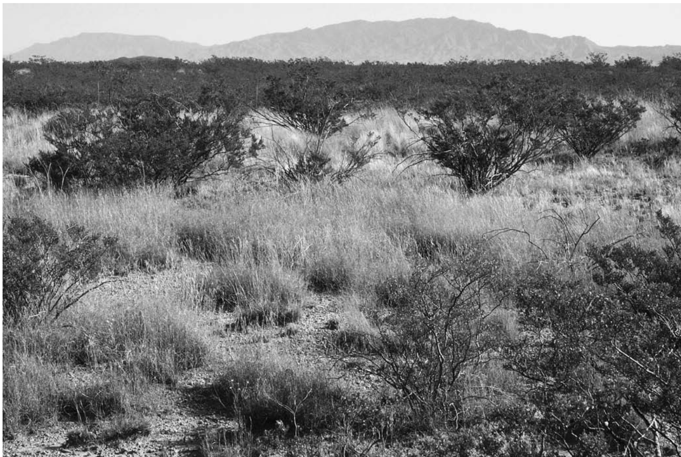
Figure 2. Woody shrubs, such as creosote bush ( Larrea tridentata ), encroaching on arid and semiarid grasslands, such as the blue grama ( Bouteloua eriopoda )–dominated grasslands at Sevilleta Long Term Ecological Research station in the southwestern United States, will most likely drive long-term carbon accretion in terrestrial systems and reduce groundwater recharge, thereby reducing the amount of water and dissolved organic carbon exported to nearby streams. Overgrazing and fire suppression drive woody encroachment, and these land uses potentially directly increase carbon availability to streams and may offset the negative influence of shrub encroachment.