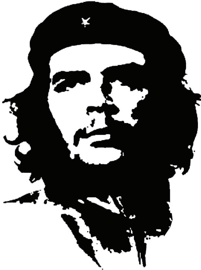
Figure 2. Popular image of Ernesto “Che” Guevara adapted from a 1960 photograph by Alberto Korda.