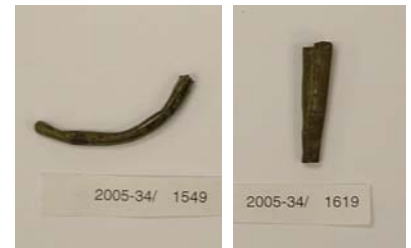
Two samples, a copper tinkler, presumably from necklace, and copper bracelet found at archaeological site in Western Indiana

When Europeans and Native Americans encountered each other in North America during the seventeenth and eighteenth centuries, a fur trade developed that dramatically transformed the lives of people from both continents. Furs and other natural products flowed to Europe in exchange for manufactured articles, the most important of which were made of metals such as brass, iron, and silver. Archaeologists like to explore the manufacturing sources and trades routes of metal objects which are largely unknown, and thus their ability to tell us about economics and cultural connections remain almost completely unexploited.