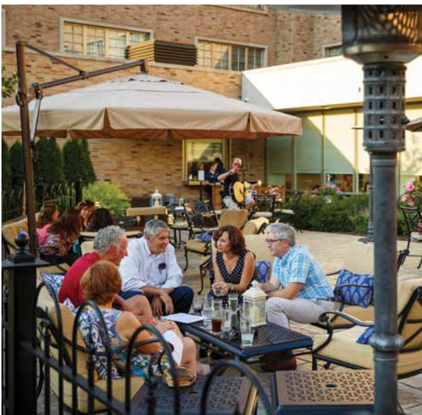
The Wind Family Fireside Terrace