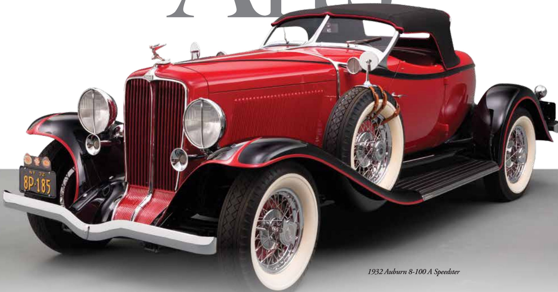
1932 Auburn 8-100 A Speedster