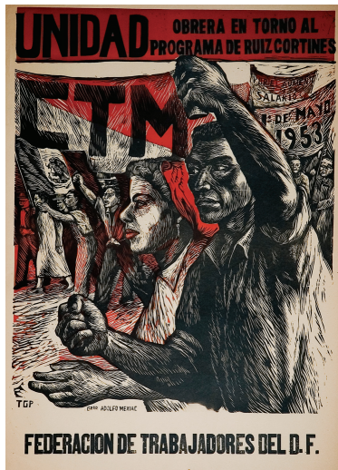
Political prints from The Popular Graphic Arts Workshop at the Snite Museum