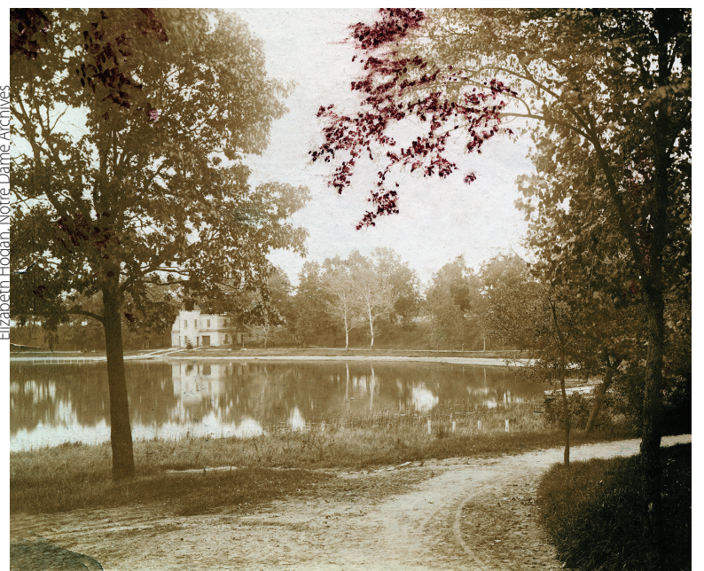
A view of the boathouse and St. Joseph Lake from the ice house, taken sometime in the 1890s.