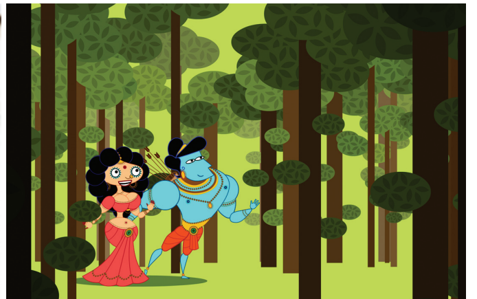
Sita Sings the Blues