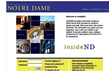
insideND's new look