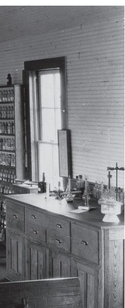
the burners and bubbling flasks also known to invite his friend