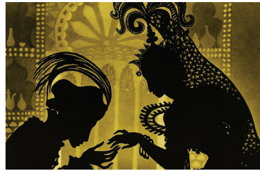
ANDkids Film Festival