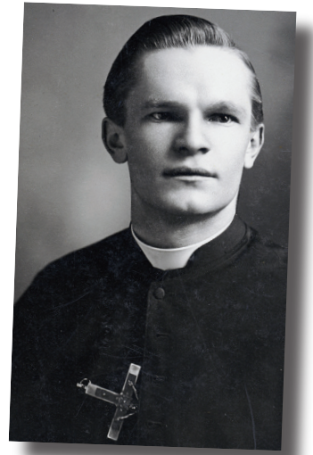
Nieuwland's legacy Pages 4-5