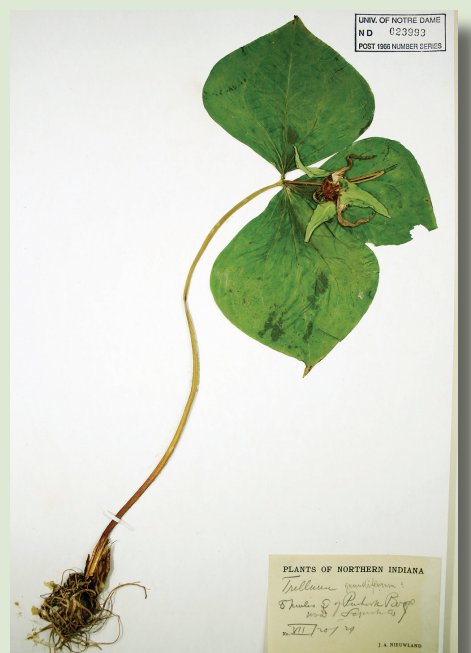
A specimen of Trillium grandiflorum (white trillium) collected by Father Nieuwland in 1929 at Pinhook Bog in LaPorte County.