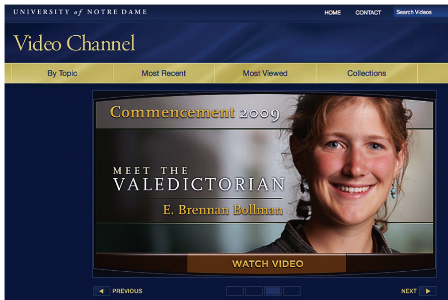
The new Notre Dame Video Channel features a rotating selection of spotlight videos, as well as archived content.

"We're excited to be one of the few universities to have its own video channel," Woodward says.