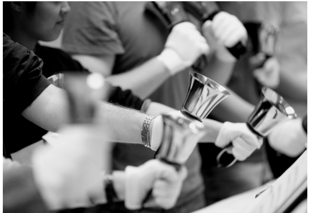
Marting, malleting, shaking and finger-damping all are techniques that Handbell Choir members learn.