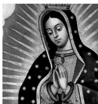
Appreciating Guadalupe ...page 2