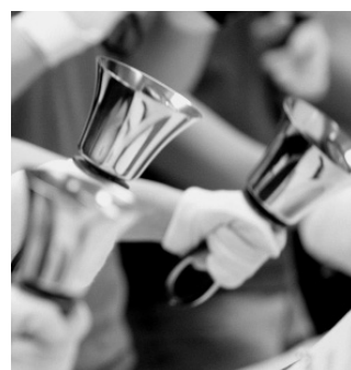
Hand bells ring ...page 4