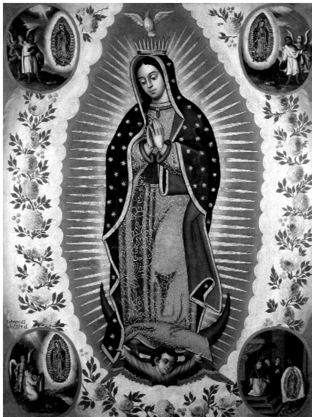
This 18th century interpretation of Our Lady of Guadalupe is part of the Snite museum collection.

Emiliano Zapata’s rebels, the pioneers of the United Farmworkers Union, the Marxist guerrillas of the Salvadoran civil war, and defenders of death-row prisoners have all celebrated her inspiration and sought her advocacy and protection.