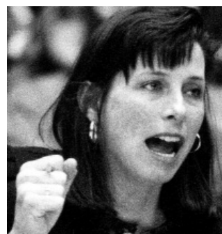
Sweet 16 all over again ...page 3