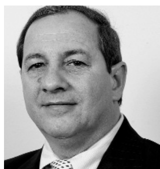
A new legend ...page 2