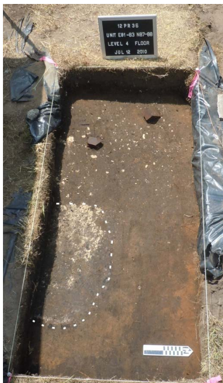
Figure 3. Unit E 81-83 N 77-78 Level 4 Floor Showing Feature 33 (outlined).

the GPR anomaly was produced by an iron railroad spike in Feature 33 and that the feature was probably an historic period bark-lined pit used to mix plaster. Figure 3 shows the oval outline of Feature 33 in the floor of Level 4. The mortar flecks and large brick fragments in the upper (western) end of the unit are part of Feature 30. Seven levels were excavated in this unit and the final floor looked very similar to that of Unit E 81-83 N 77-78.