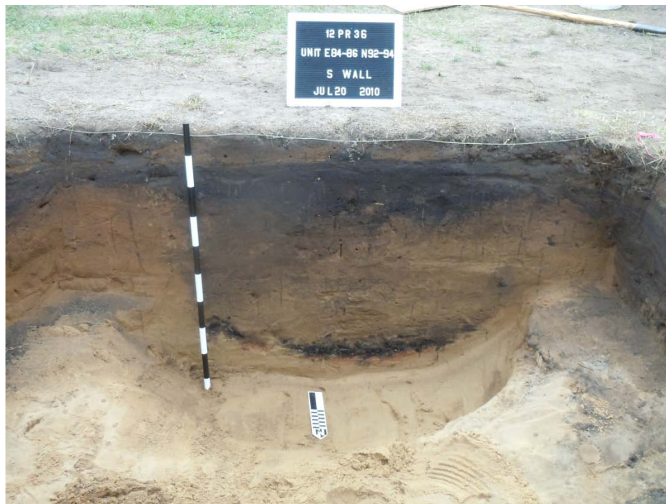
Figure 6. Feature 33 in Profile in the South Wall of Unit E 82-84 N 92-94.

f. Units E 79-80 N 86-87 and E 80-81 N 86-87 were opened when spare labor was available during the July field season and on August 28 to demonstrate excavation during the Aukiki River Festival. These units produced the typical early twentieth century rubbish characteristic of the upper levels of Feature 25. They were excavated to create some working room that would facilitate a deeper test of Feature 25 in the future.