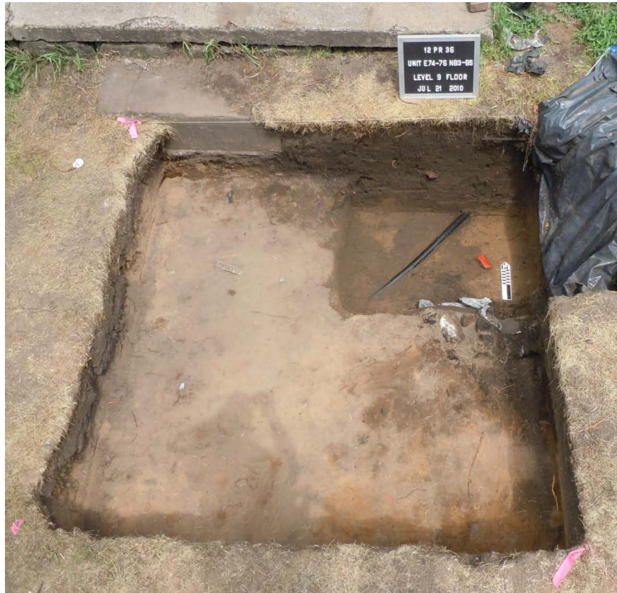
Figure 4. Unit E 74-76 N 83-85 Showing Plastic Pipes.

d. Unit E 80-82 N 89-91 was placed over the approximate location of the northeast corner of Feature 25. Excavation proceeded slowly in this unit because of its relatively large size and complex deposits which consisted of a confusing array of soil lenses of different sizes and soil types. These were eventually determined to have been associated with soil disturbance produced by the placement of the concrete foundation of a garage that stood in this part of the site (the rectangular trench in the floor is a footer trench for the foundation). Seven levels were excavated. The floor of Level 7 contained a rectangular patch of dark soil in the southwest corner of the unit (Figure 5, upper right) that could be the northeast corner of Feature 25, but that was not confirmed because the season ended before another level could be excavated. A semi-circular patch of reddened soil near the southeast corner of the unit could be an Upper Mississippian pit.