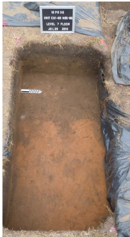
Figure 2. Unit E 81-83 N 85-86 Level 7 Floor Showing Probable East Edge of Feature 25.

a. Unit E 81-83 N 85-86 was opened to determine the southern edge of Feature 30 (a dense deposit of early twentieth century rubbish) and perhaps the southern corner of Feature 25. Feature 30 extended only about 25 cm into the unit and was completely removed by Level 7 and the eastern edge of Feature 25 was clearly visible in the floor (Figure 2).