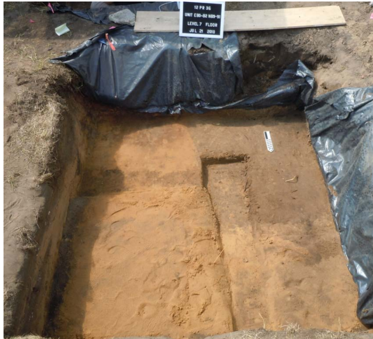
Figure 5. Unit E 80-82 N 89-91 Level 7 Floor.

e. Unit E 82-84 N 92-94 was placed adjacent to a unit from an earlier season (E 80-82 N 92-94) that had produced undisturbed Upper Mississippian roasting pits. Very quickly (by the end of the second level), the new unit contained soil stains characteristic of prehistoric pits along with the eastern edge of the earlier unit. It was found that the location of the new unit was about 25 cm too far to the west compared to the earlier unit. One pit (Feature 44) was relatively small and shallow with no evidence of in situ burning. The other (Feature 43) was bisected by the south wall of the unit to produce a beautiful profile of a classic Upper Mississippian roasting pit (Figure 6). Several flotation samples were taken from the feature (they have not yet been analyzed).