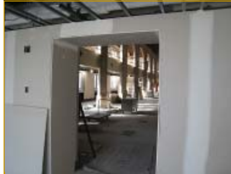
Looking into the renovation of the Main Reading Room. (See more photos on page 4 and 6!)

We are quickly moving toward the end of the fall 2009 semester. For me and my colleagues in the Kresge Law Library, the end of this semester will mean that we are only one semester away from the completion of the renovation of the “old” law school. As the 2010 spring semester ends, we will be starting to move all of our print volumes and microforms into Biolchini Hall. This edition of the Law Library News contains some photographs of the construction site. The Reading Room ceiling has been finished, and I think the final renovated space will be spectacular. We will also be able to provide a significant number of group study rooms along with