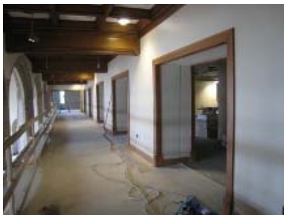
AT LEFT: A view of the mezzanine looking toward the former Center for Civil and Human Rights

AT RIGHT: This photo shows where the permanent Circulation desk will be (just behind the wall where it is in the temporary library space) and, on the right, the beginning of the special collections room.