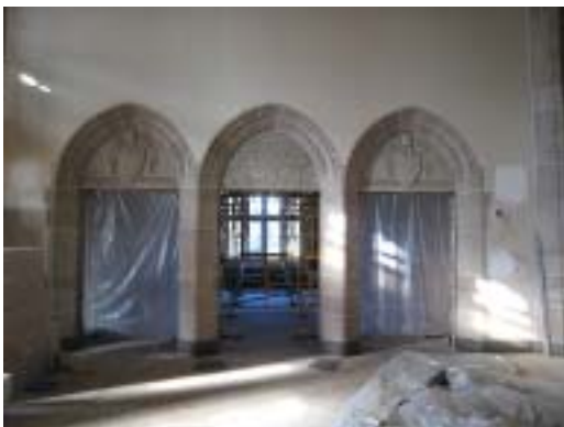
These views of the Main Reading Room, both facing north, were taken in October 2009.