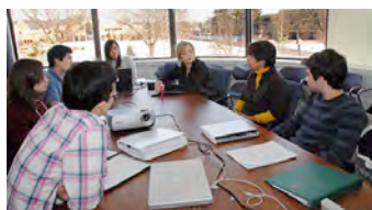
Class of Spring 2009