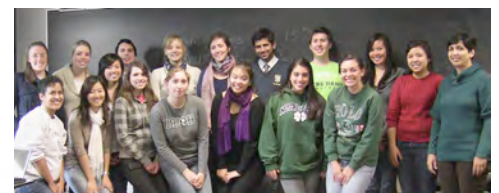
Class of Fall 2009