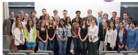
Class of Spring 2011

disease. By defining disease manifestations and progression, natural histories allow physicians to determine whether experimental therapies are working.