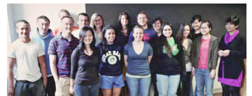
Class of Spring 2010

The class became a model to determine whether students can be trained to accurately assess and define rare disease natural histories from patient records. Upper-class pre-med