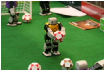
Robo Cup Soccer