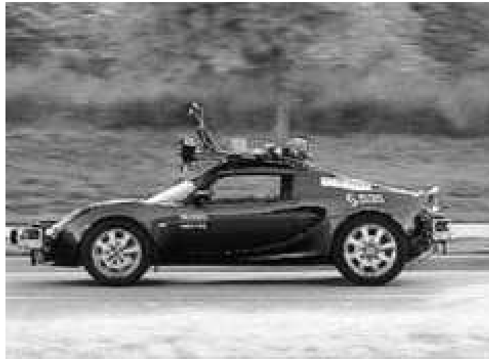
NC State Robotic (Driverless) Car in Finals